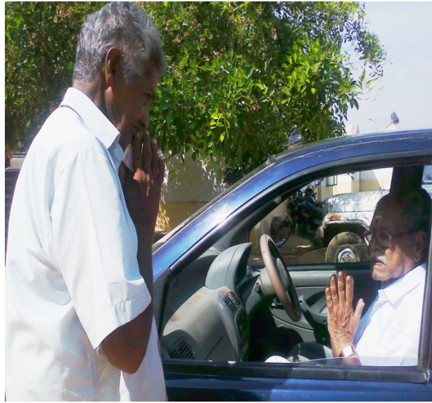
Our TEV Residents – Thanks to donor