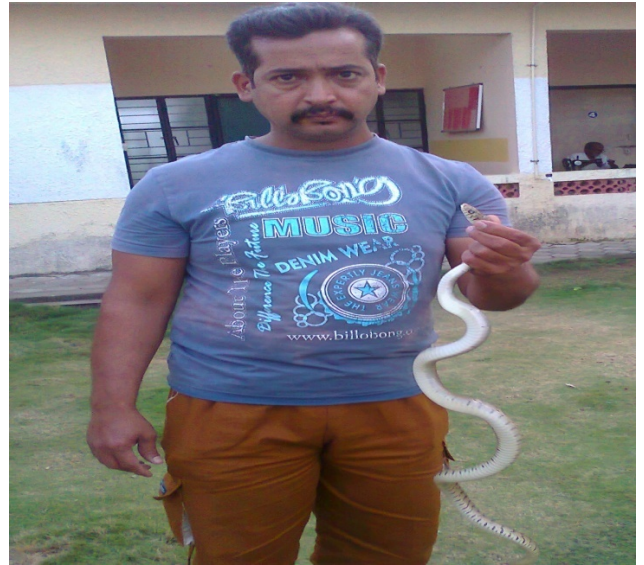
During the cyclone , Village volunteer catch snicks