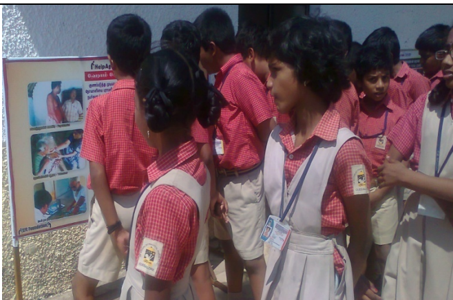
School student s enjoying – Photo exhibition