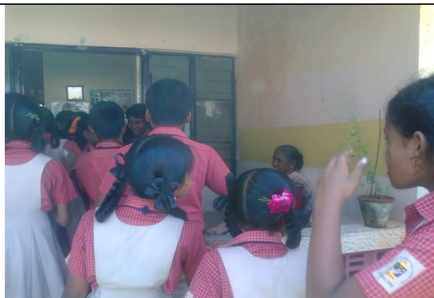
Interacting with our Residents